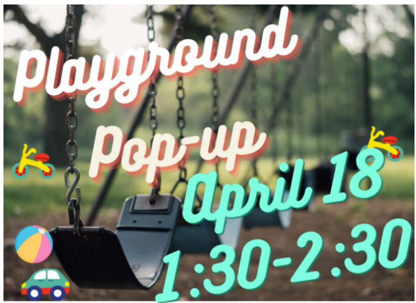
Kids are invited for some fun on the playground. Parents are invited for some fellowship time. Take home a popsicle!