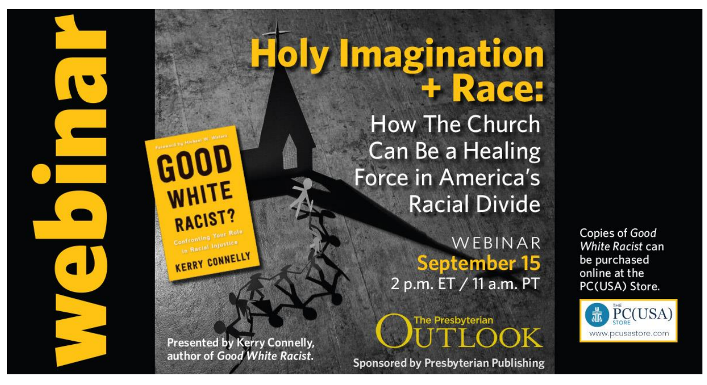
Contact the FPC office if you wish to join this Zoom presentation.