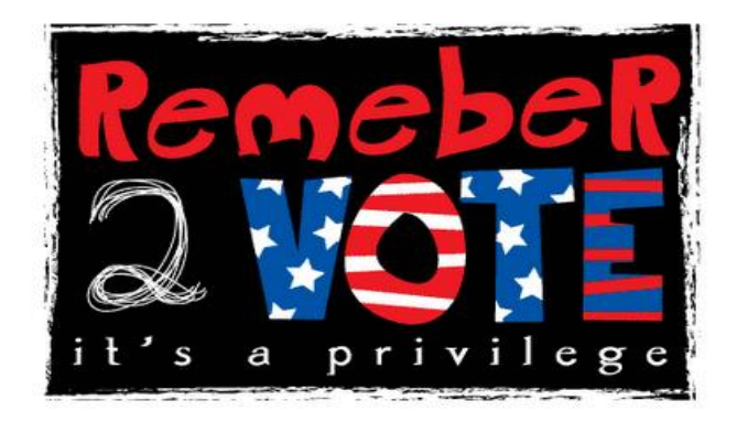
Tuesday, November 3, 2020 is Election Day!

To reserve a Sunday, click <u>here</u> or call the church office (919-682-5511). Guidelines for donating flowers for worship can be sent to you. The florist will take care of the delivery!