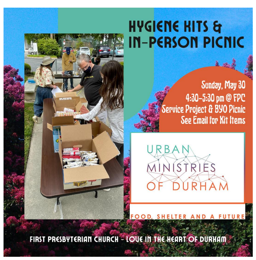
Hygiene Kits & In-Person Picnic

Join us on Memorial Day Sunday, May 30, as we love our neighbors and reconnect with each other. We are collecting and assembling items for hygiene kits that our friends at Urban Ministries will distribute. (See this Amazon wish list for the specifics: <a href="mailto:Amazon.com">Amazon.com</a>) After we're done, there will be yard games and a bring-your-own picnic on the back lawn. If you're in town, join us on May 30, 4:30-5:30 pm. If not, or if you're not ready to, you can drop off contributions at the church on Monday, May 24 and Friday, May 28. You are also welcome to assemble kits at home and drop them off.